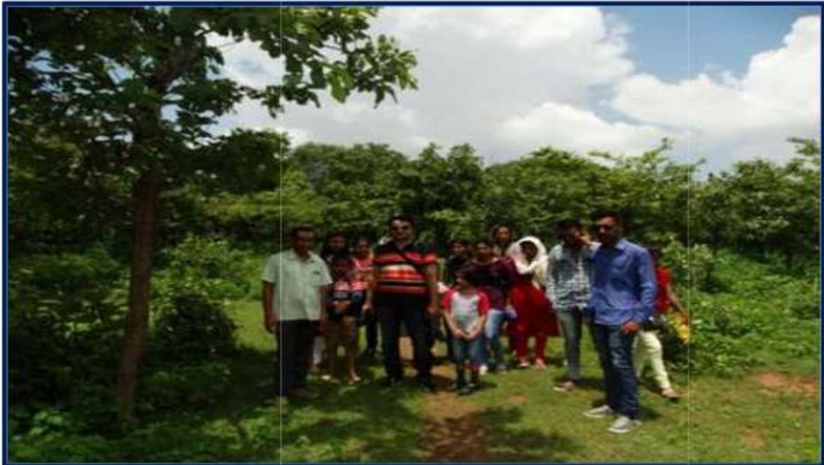
Biological Excursion Tour-Study tour was organized on 19 August 2017 at Devlipar and Mohadi Dist. Bhandara.