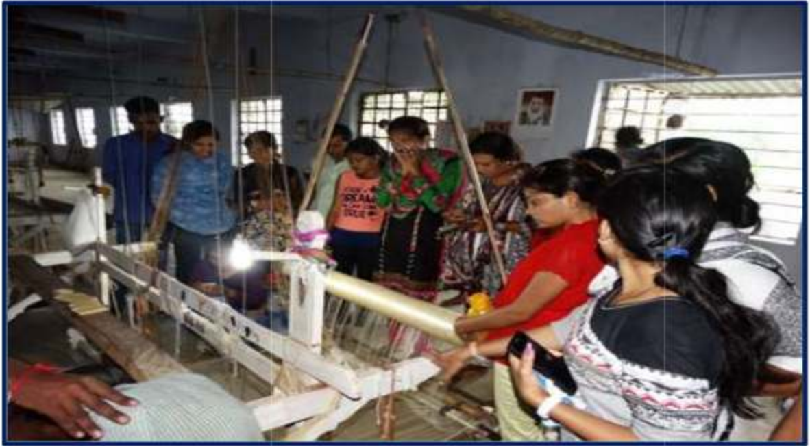
Students getting knowledge of preparation of Tasar Silk sarees at Mohadi, Dist. Bhandara.