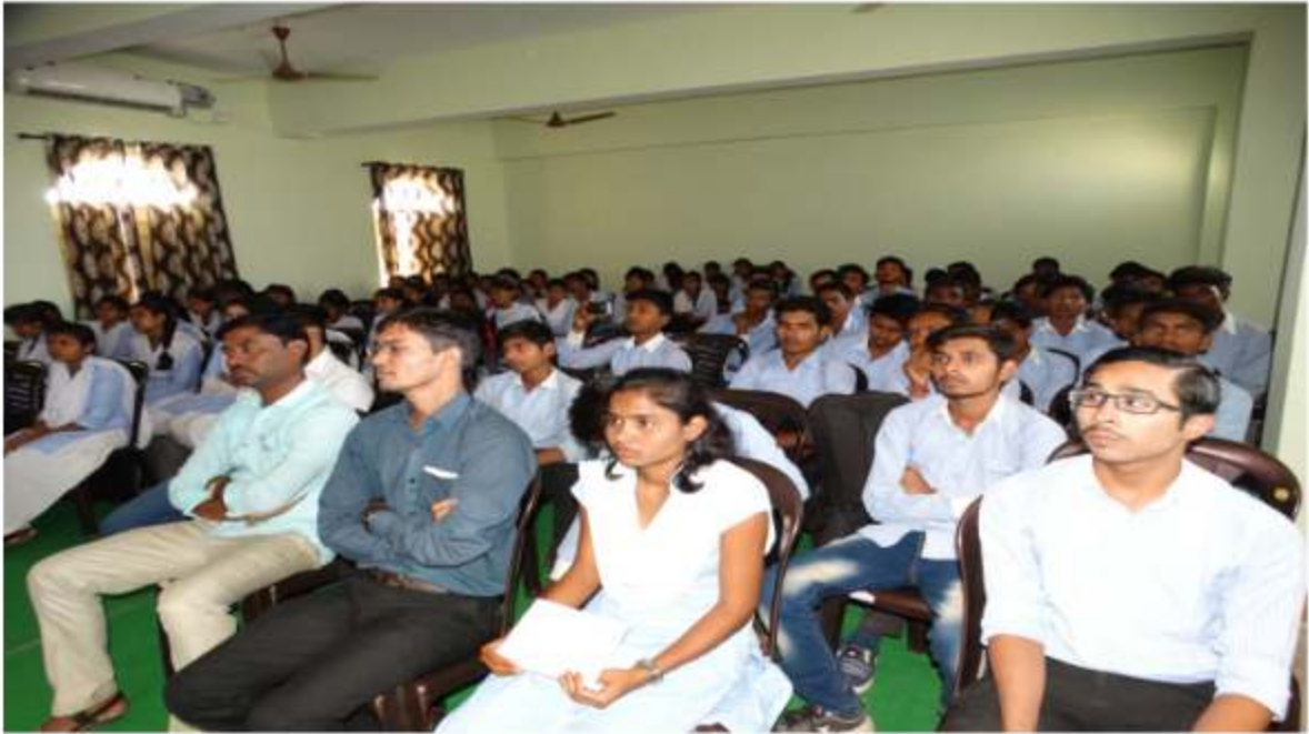
Student and Professor were present on the occasion of World AIDS Day