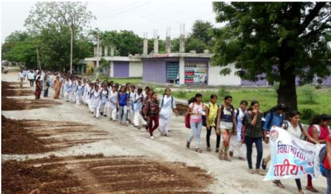
voter awareness rally