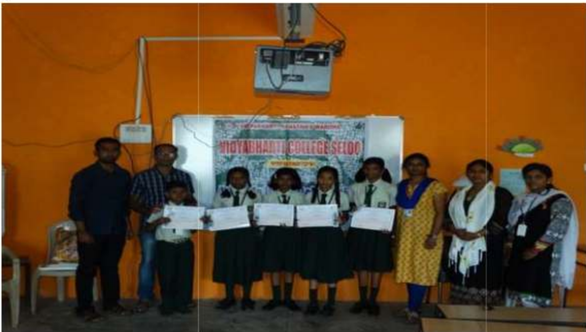
Prize distribution for poster competition held in School of brilliant (Convent) during wildlife week 2017-18