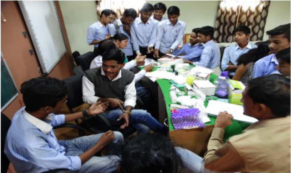
Medical team examining students during a sickle cell awareness programme