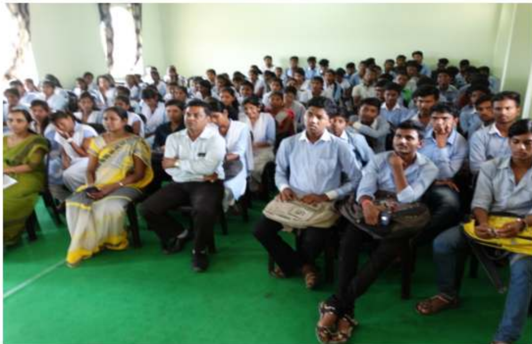
Students and Professors were present on the occasion of Reading Inspiration Day program