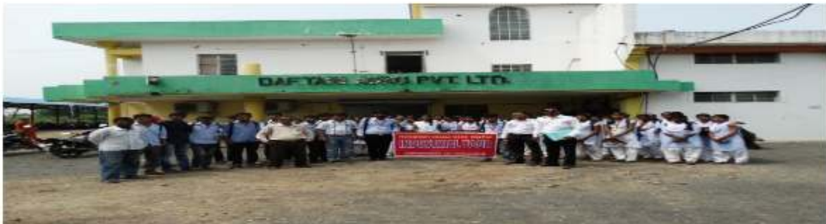
All faculties and student participated in this industrial visit at Daftari Agro Pvt. Ltd Seloo, Wardha