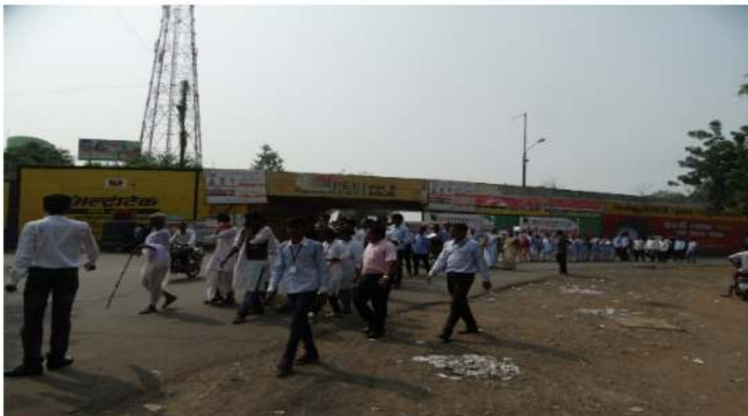
Students and professors while spreading awareness through the rally on the occasion of Gandhiji and shashtrijijaynti