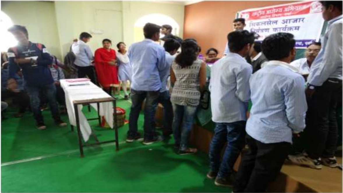
Student and Professor were present on the occasion of Sickle cell awareness program