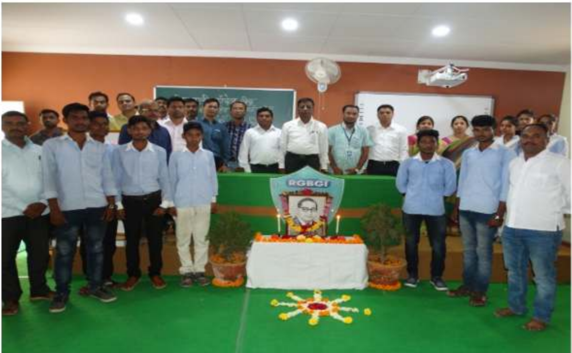
Student and Professor were present on the occasion of Mahaparinirvana Day