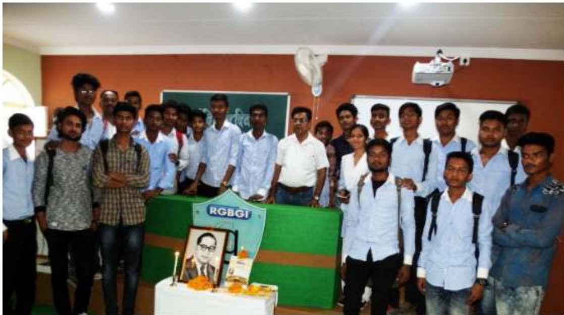
Student and Professor were present on the occasion of Constitution Day