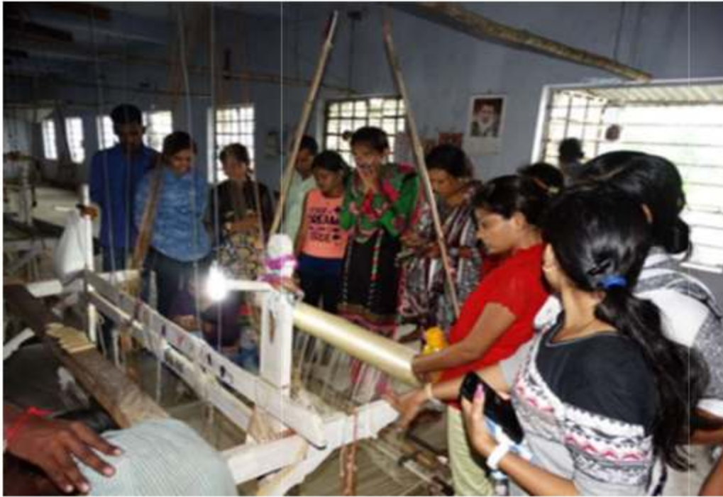
Students getting knowledge of preparation of Tasar Silk sarees at Mohadi, Dist. Bhandara